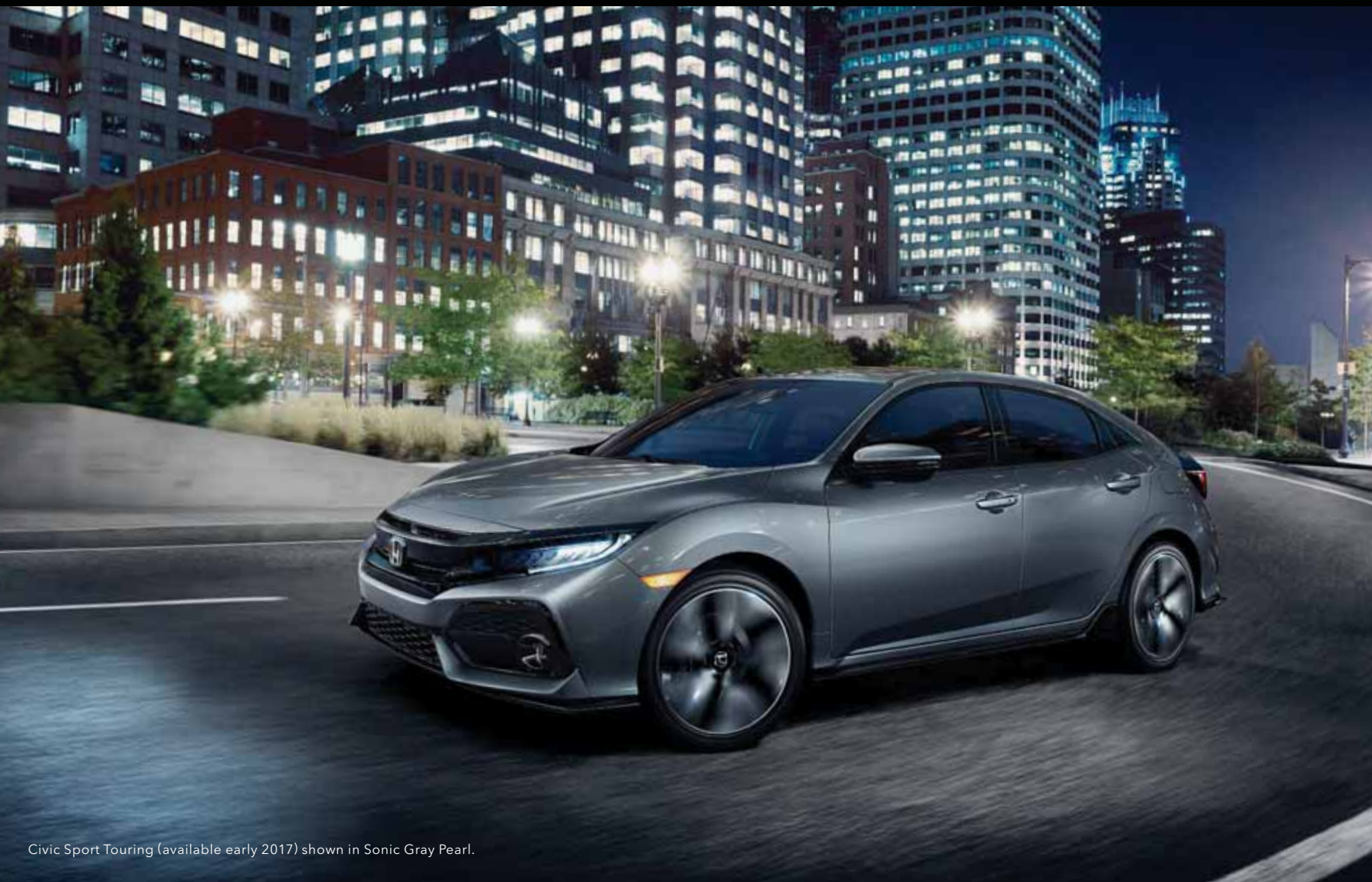
Civic Sport Touring (available early 2017) shown in Sonic Gray Pearl.