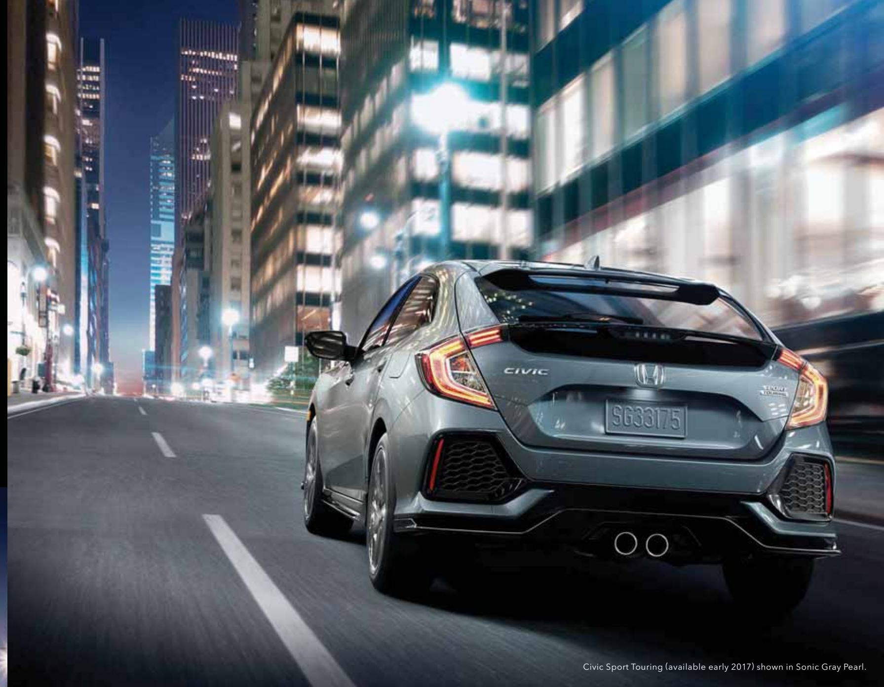
Civic Sport Touring (available early 2017) shown in Sonic Gray Pearl.

Distinct impressions are in the details. The disruptive design of the Civic Hatchback can be seen from front to back, including taillights accentuated by sleek LED light bars.